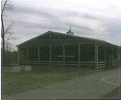
New Show Arena