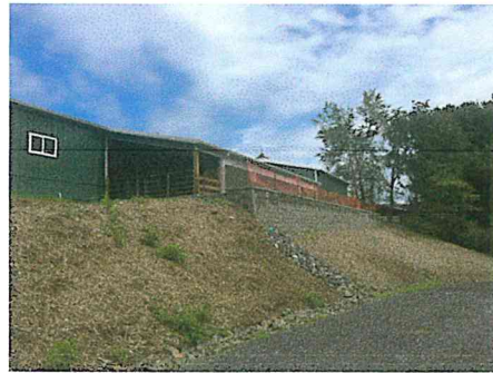
New Swine Building and Retaining Wall