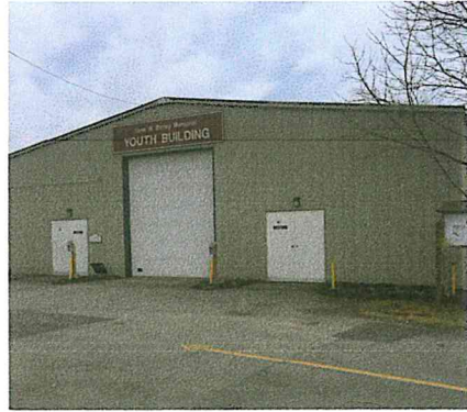
1986 – Youth Building