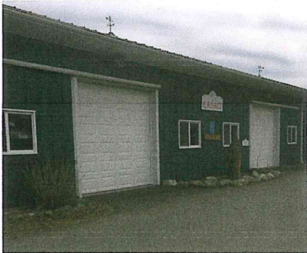
1995 – Rabbit Barn