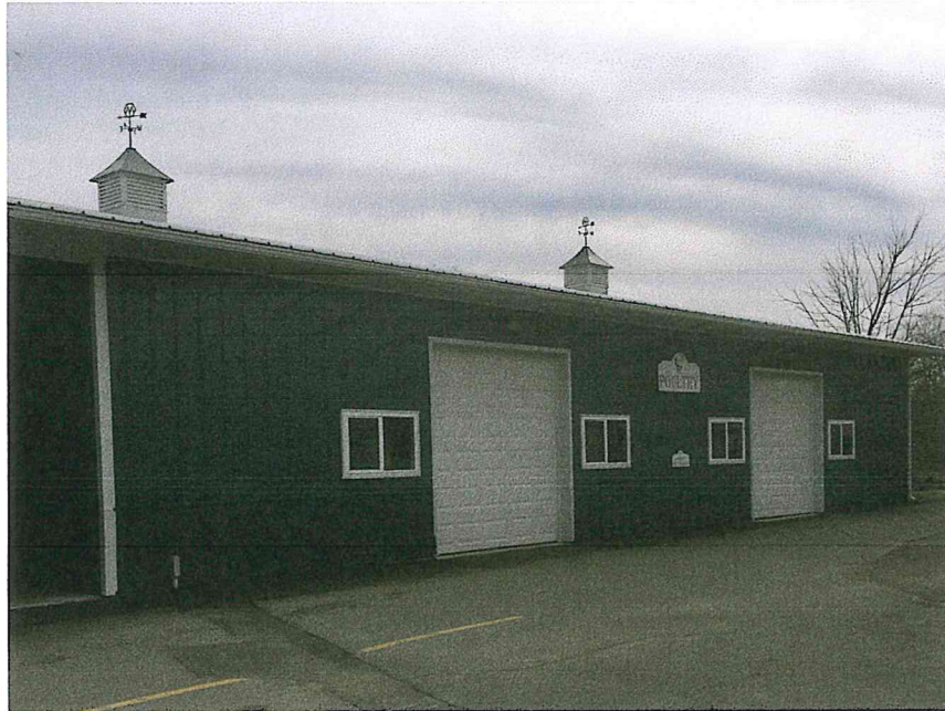
New Poultry Barn