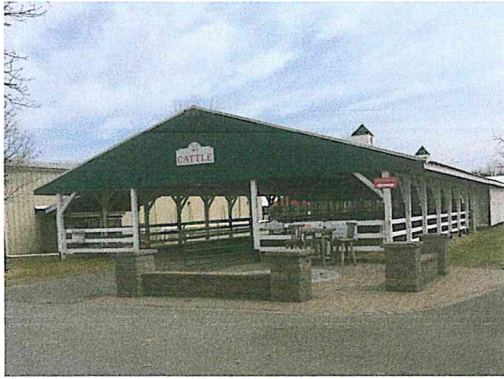
1970 Cattle Barn – Addition 1998