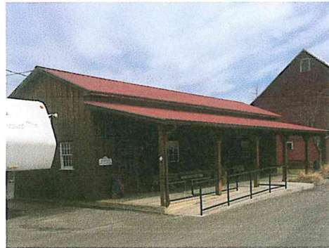
2005 – Home Arts