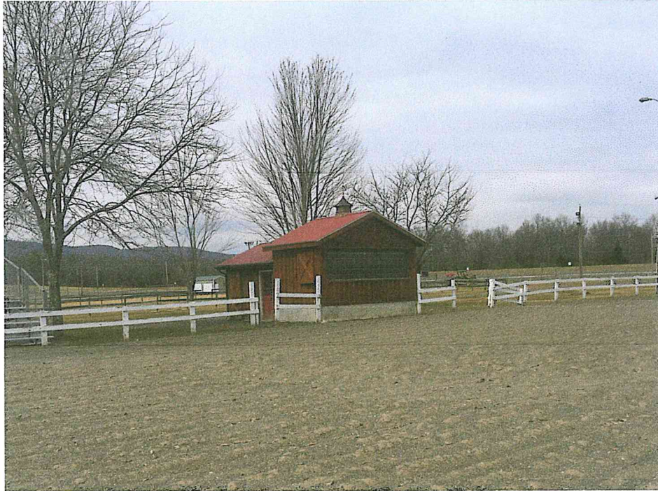
New Horse Ring Announcer's Booth