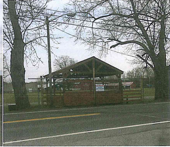
New Entrance Way