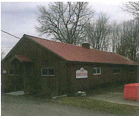
2005 - Remodeled Home Arts