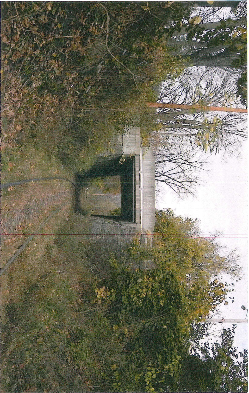
Albany Avenue Underpass- 15' Wide