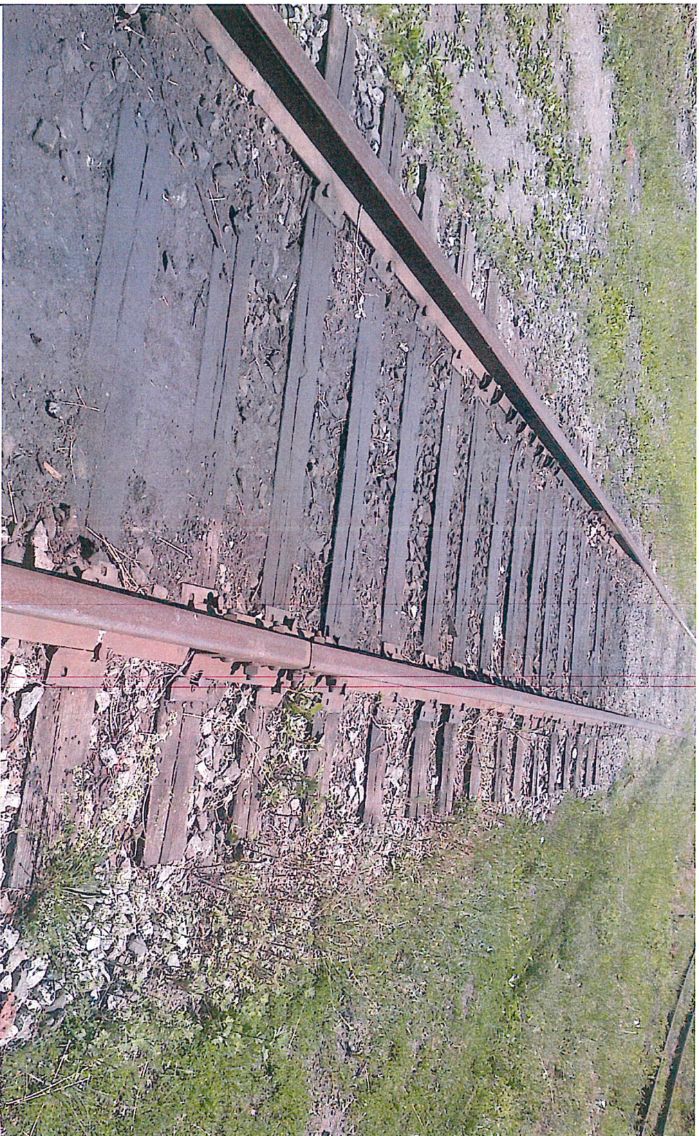
Cornell St. Former Rail Yard Contamination