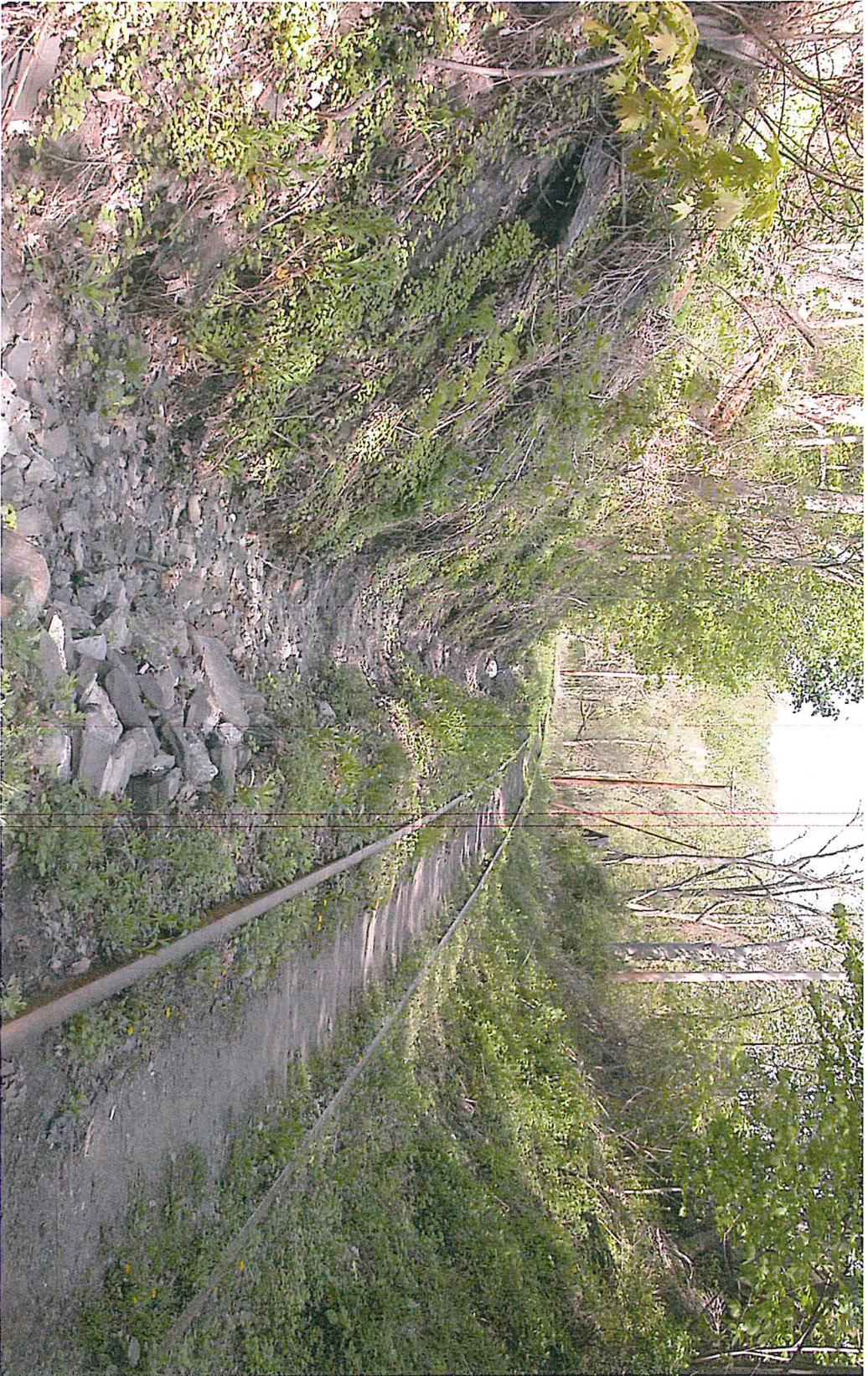
Cut Area with Drainage Issues