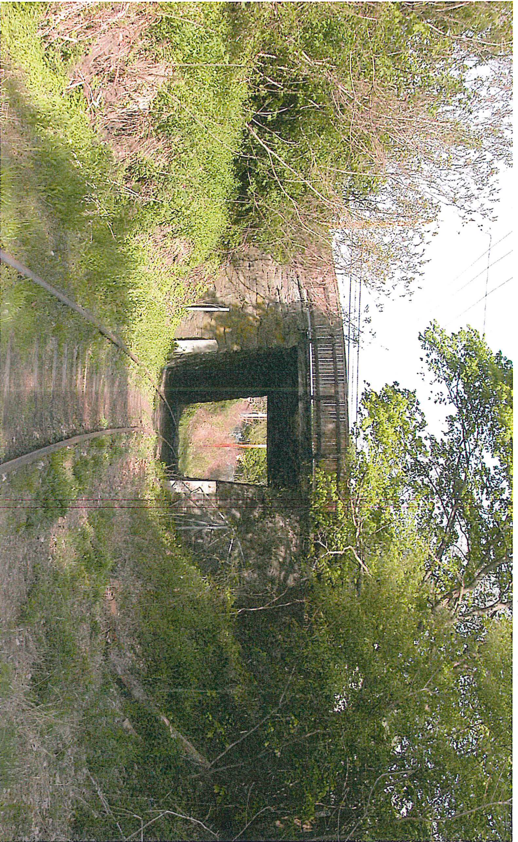
Elmendorf Street Underpass- 15' Wide